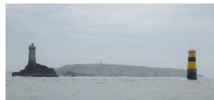
Raz de Sein - benign

Tides are large & fast. Get the timing (and weather) right - headlands are a joy.