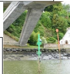
Auray motorway bridge - 14m above MHWS