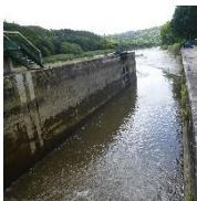
River Aulne - Guily Glaz lock at low water

Rivers at low water can be “eye popping”.